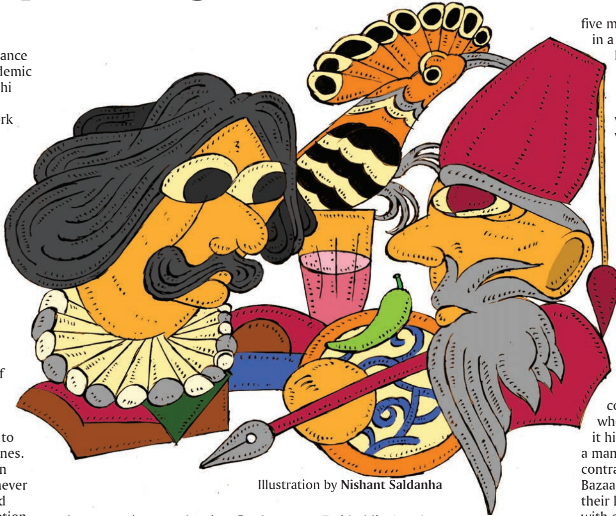
Illustration by Nishant Saldanha

The editor asked me to write a ghazal for Goa for the first edition. The ghazal, originally from Arabic, but closest to me from Urdu, via Persian, is a tight and demanding form, where