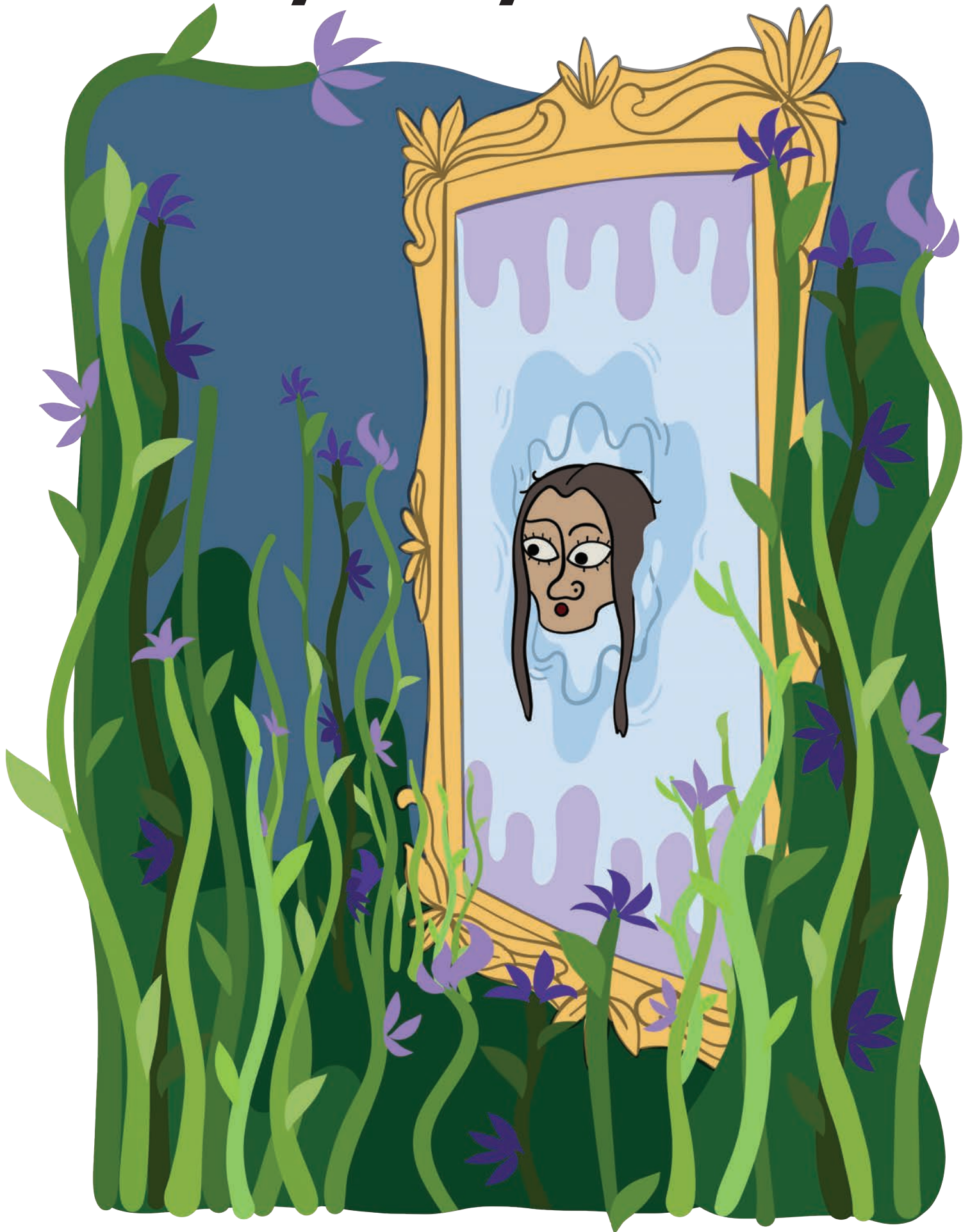
Illustration by Chloe Cordeiro

This gullibility is not foolish. It is a sign that deep down, we are all poets. All we need is belief.