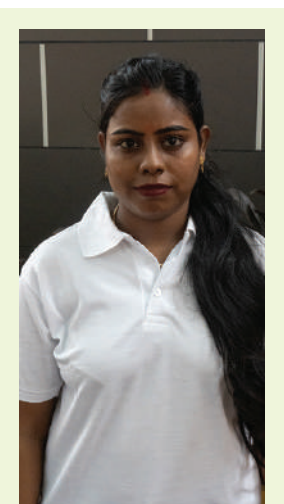
I'm looking forward to my work here. There are a lot of places to see in any state or city, but what's unique about Goa is that the sites are surrounded by greenery.