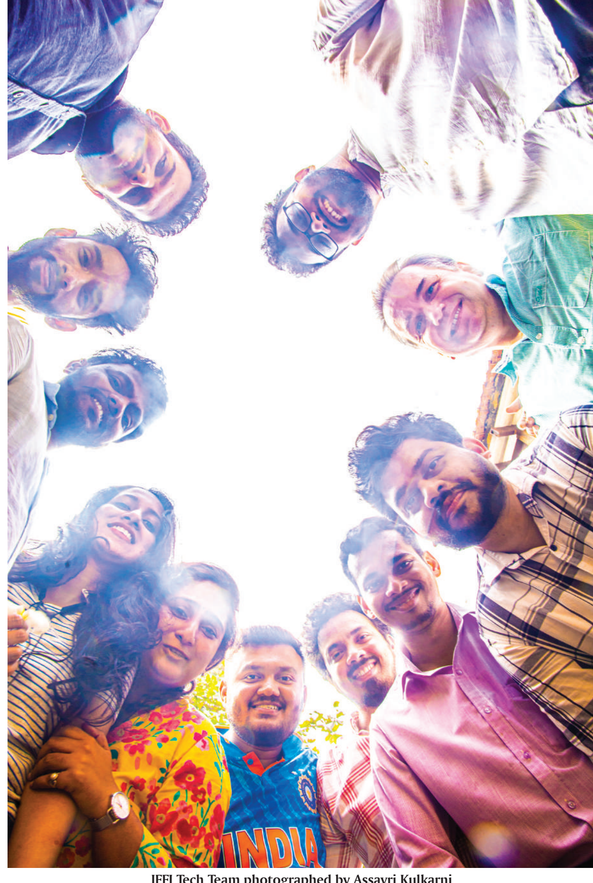
IFFI Tech Team

The app also takes into account the distance between venues to avoid overlaps, so it's literally impossible to book a film that you won't be able to attend.