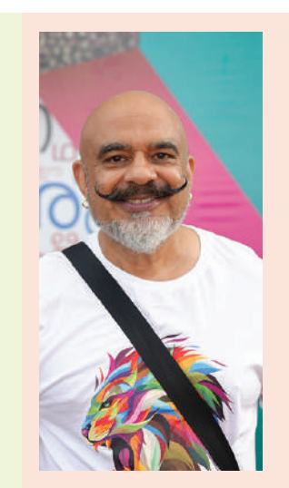
We've already visited MAMI, and, after IFFI, we're going for the film festival in Kerala. Among all the festivals, however, I think IFFI has the most beautiful ambience.